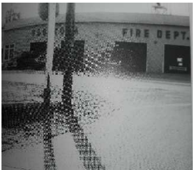
Here's where we pick up the story written by our anonymous fire fighter:

Many Saratogans still remember that the firehouse had an electric siren on top of the roof that produced a distinctive but memorable wail.