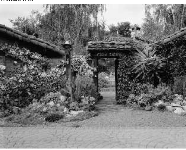
Over 23,000 handmade roof tiles were used to cover

The over 800 windows provide natural light for the house. Because of the number and irregular size of the windows, the women chose discontinued plate glass windshields from a junkyard. Using a glass cutter, they hand cut the glass needed for the windows.